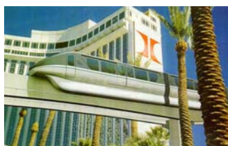
The new monorail system in Las Vegas